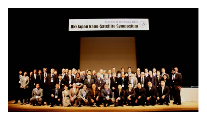
MIC2 final presentation, Oct. 10, 2012, Nagoya, Japan