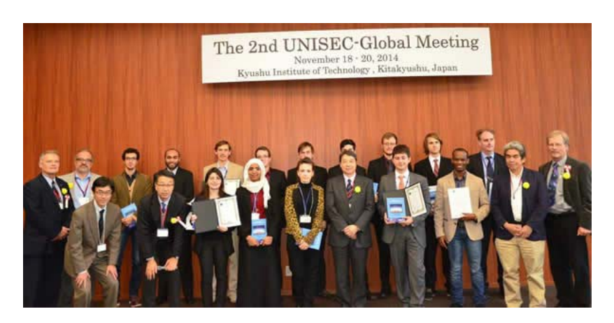
MIC3 finalists and reviewers, Nov 19, 2014, Kitakyushu, Japan